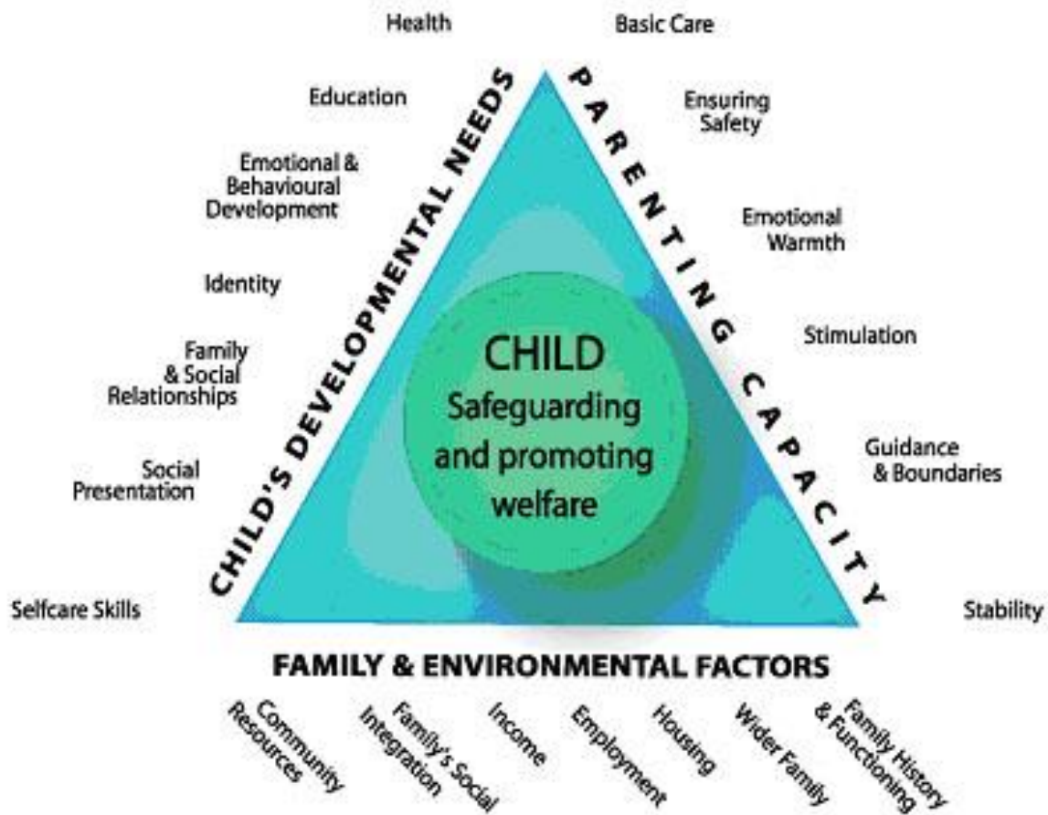
Figure 1 – The Assessment Framework 50